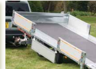
Drop-down sides Fully removable for flat-bed use, either in lightweight aluminium or galvanised steel