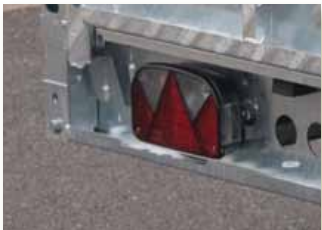
Protected lighting Full EEC directive approved light system is well protected by the strong chassis surrounding the units.