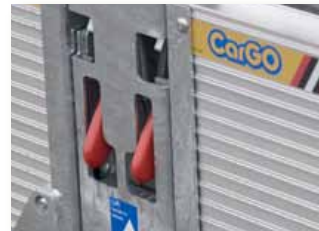
'Auto-LOCK' Aluminium sides feature a brand new integral locking system with slam-shut facility