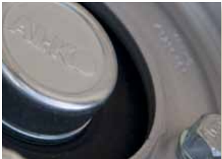
Heavy duty bearings Sealed wheel bearings for reduced maintenance