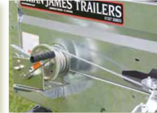
Powerful winch Manual winch has a central pull position and a 2.25t cap