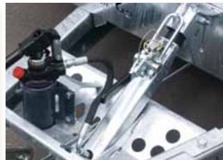
Hydraulic Tilt-bed Lowest loading angle and easy operation. Bed lock-down for travel