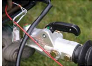
Locking head Integrated coupling lock. Extra security items available