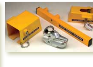
Security products Wheel bar locks, External box locks, Datatag electronic ID transponder