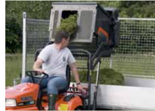
High mesh sides Removable 0.8m high side mesh extensions, all around