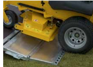
Double fold tail panel A combination of aluminium and steel construction with 'blade' style lead in