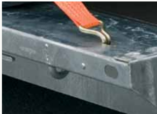
Strap points and hooks Multiple attachment hooks for securing loads inboard with ratchet straps and rope hooks