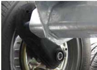
Progressive suspension Independent suspension offers superior ride characteristics and long-term durability