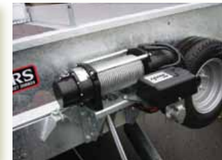
Electric winch Available in a range of sizes. Power by on board battery pack or HD vehicle power loom