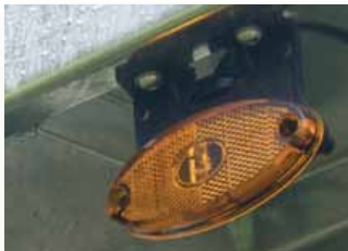
LED side marker lighting Best illumination and reliability (Total length over 6.0m)