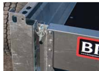
Easy retainers Steel sides feature tapered cotter pin retainers, with wire cables to reduce rattle