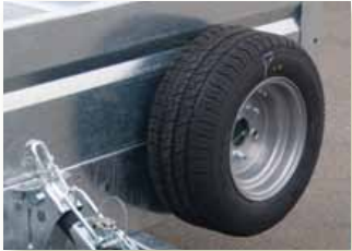
Spare wheel Supplied with all CarGO trailers