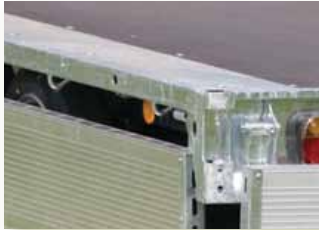
Chassis A unique 5 year chassis warranty