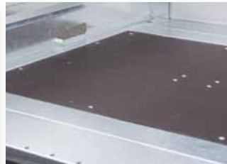
Reinforced flush floor 18mm commercial ply deck, steel edges and central deck support