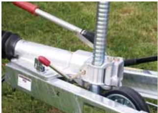
Jockey wheel Heavy duty, fitted as standard