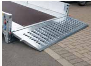
Low angle ramp panel Quick and easy gas spring assisted operation. For machinery or vehicles. Hi-grip surface.